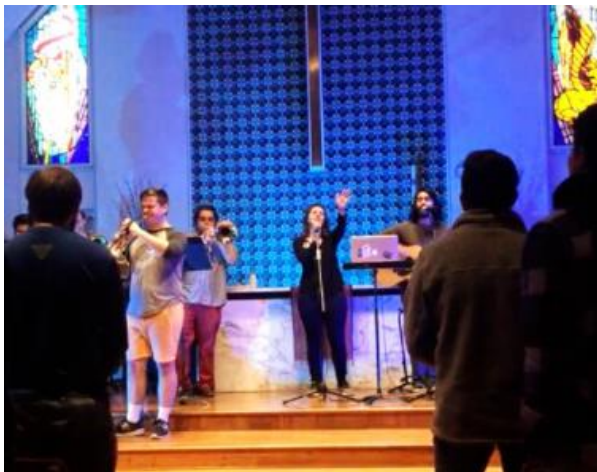
Pictures of Student Ministry at Texas State U., supported by Mission Presbytery