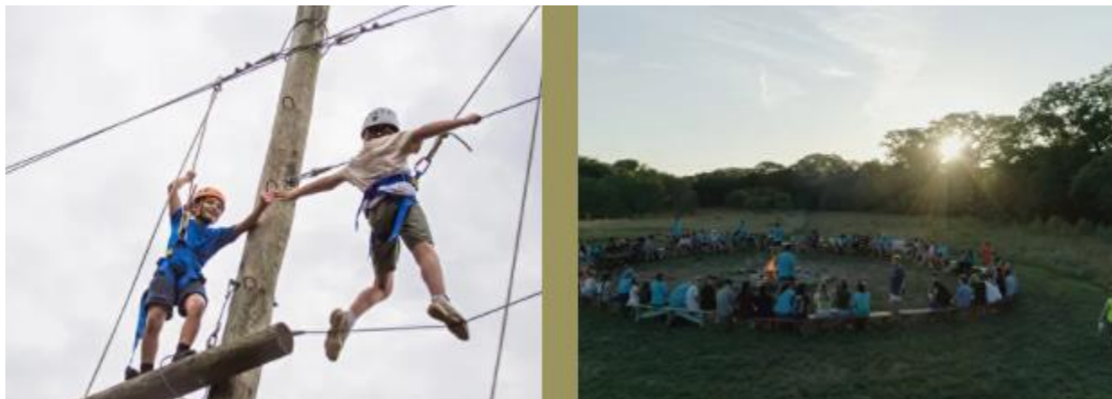
John Knox Ranch.....lifechanging experiences for young people with God and others

3. Enable mission and witness to the gospel that congregations cannot accomplish alone (includes $851,475.58 or 60% of expenses). This includes the committees for Mission Outreach and Justice, Presbyterian Disaster Assistance, Youth Connections, along with Presbyterian Women and John Knox Ranch.