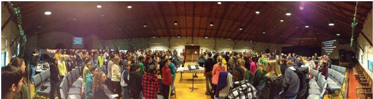
Midwinters at MO-Ranch

The Stewardship & Fiscal Oversight Committee (SFOC) presents, in addition to the usual line-item budget, this narrative budget to show more graphically where Mission Presbytery's money comes from in broad categories and where the money goes using the four categories of the mission statement above. We hope this will allow for a better understanding of the presbytery's finances and will encourage increased generosity by our congregations so that we are best able to finance the mission of the presbytery.