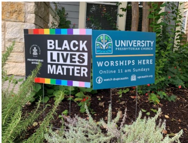
University PC, Austin with a vibrant campus ministry

2. Recruit, receive, ordain, develop, and care for those called to service in the church (includes $185,449.71 or 13% of expenses). This includes the Committees on Preparation for Ministry, Representation and Participation, Pastoral Care, and the Permanent Judicial Commission