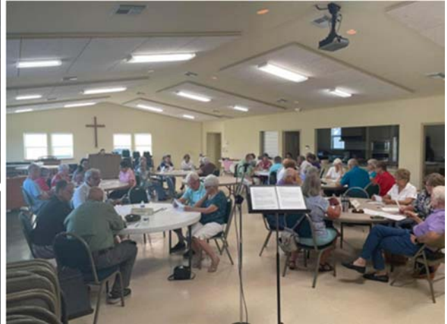
Gathering at Canyon Lake

How much is this worth? If you had to start from scratch, it would be a lot. Please note that on the pie chart, the projected income needed for 2023 is ~$1.6 million. Also notice that the individual churches' anticipated contribution is only $385,000 which is only 23% of the pie . How can we do this? With incredible leverage!