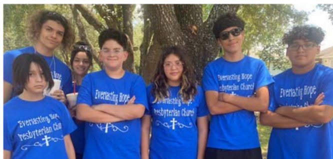
Youth in Taylor

It's hard to imagine with today's JKR success that not many years ago JKR was considered for possible sale -- and had it been sold, it would be impossible to rebuild what we have now. It takes the machinery and resources of the presbytery to keep it running.