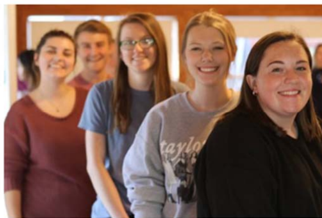
College Campus Ministries

In conclusion, you, the churches of Mission Presbytery, get (at least) $1.6 million worth of services for 2023 and only pay for $385,000 (23%) of it - due to generous giving in the past, careful investing of funds over the years, wise setting of fees, and maintaining some excellent property. And, yes, the presbytery could charge a fee - take that $385,000, divide it among the total number of members of our 120 churches, and send each church a "bill." Most presbyteries do that. For years,