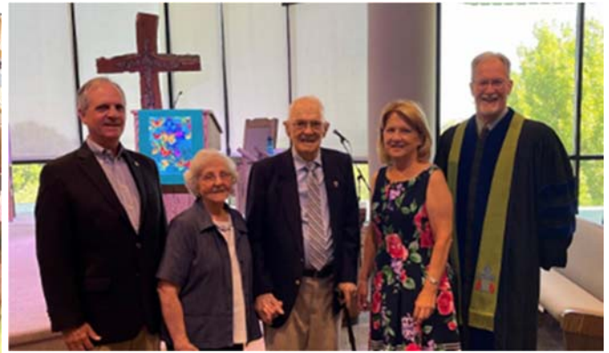
From young disciples.....to celebrating 70 years of Ministry

The third category is “leases and principal payments (14%).” The presbytery owns “The Broadway Building” which not only houses the presbytery offices but also brings in rental income from other tenants. The presbytery also received payments from churches it has lent money – these are referred to as “principal payments.”