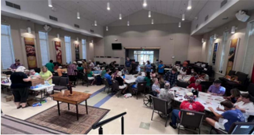
Grace PC in Round Rock held their annual “Be the Church Day” event

Now you might think, “This pays for itself and doesn’t need to be in the budget.” Suppose there were no JKR. Imagine a church wanted to have a camp with a thousand students. Sure, they could get registration money from people, maybe lots of people, but how will that be processed? Who will run the thing? Who will train the youth leaders, and where will you get them all? Who will develop the curriculum and activities? Where will they get the land to be on? Who will build the pool, the dining room, the showers, the sleeping areas? How will you feed them? How will the kids be kept safe with policies and procedures? Who will attend to the legal responsibilities? When you think about it, it is too daunting to imagine any church being able to pull this off, no matter how big it is.