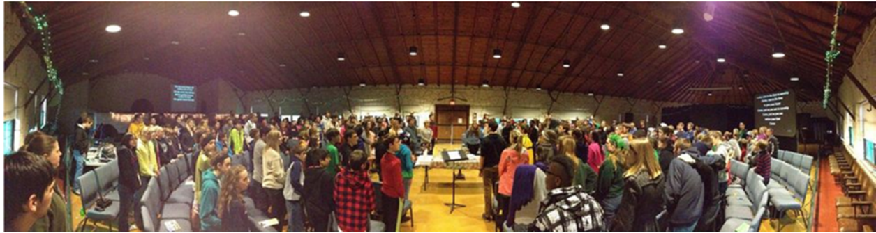
Panorama shot of Midwinter Gathering

We are a connectional church: whereas an individual congregation does ministry mostly in its own area, the presbytery is a group of churches working together for the good of all the churches, doing things that a single church cannot do, and providing oversight for all the churches in its area. We are Mission Presbytery.