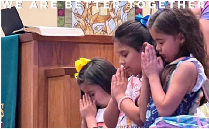
Prayer time at FPC New Braunfels

Mission Presbytery has not done that, but instead has relied on the generosity of our member churches to give to Benevolence each year.