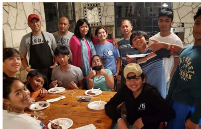
Youth in Corpus Christi

To a smaller degree, the same is true for YCC and events like Midwinters. Yes, it pays for a lot of its own costs through fees, but again it is the YCC, the leadership at the presbytery level, etc. that makes these events possible and probably beyond the reach of any particular church in the presbytery.