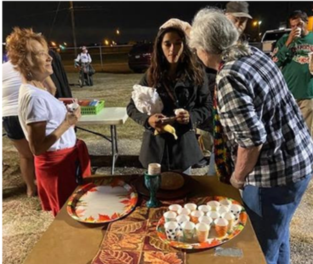
Serving the homeless in Corpus Christi