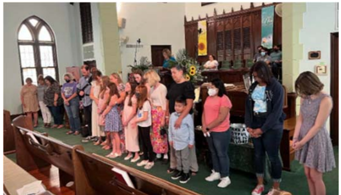
Together at FPC Brownsville

The fourth category has to do with youth: John Knox Ranch and the activities of the Youth Connection Committee, which puts on Midwinters, Main Event, and Youth Triennium. Notice that this is about half the entire budget (49%) , and almost entirely paid for with fees.