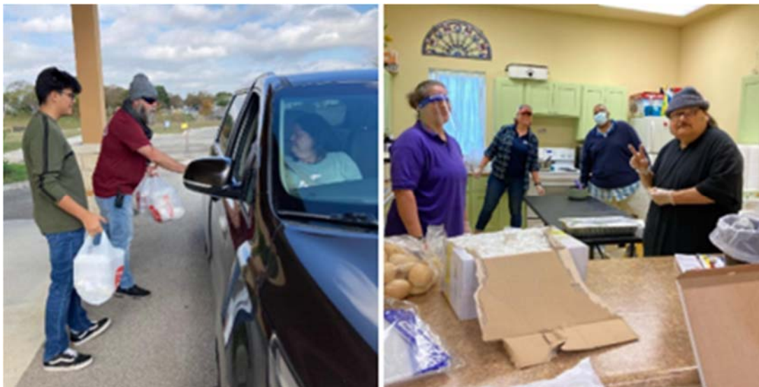
Delivering Thanksgiving meals in New Braunfels

How much is this worth? If you had to start from scratch, it would be a lot. Please note that on the pie chart, the projected income needed for 2023 is ~$1.6 million. Also notice that the individual churches' anticipated contribution is only $385,000 which is only 23% of the pie . How can we do this? With incredible leverage!