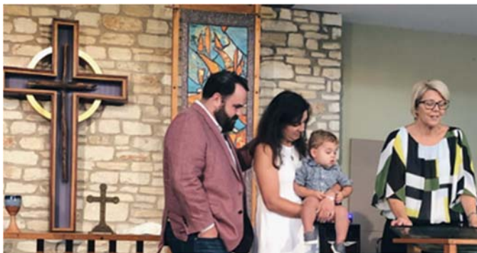
A baptism at Shepherd of the Hills

The third category is “leases and principal payments (14%).” The presbytery owns “The Broadway Building” which not only houses the presbytery offices but also brings in rental income from other tenants. The presbytery also received payments from churches it has lent money – these are referred to as “principal payments.”