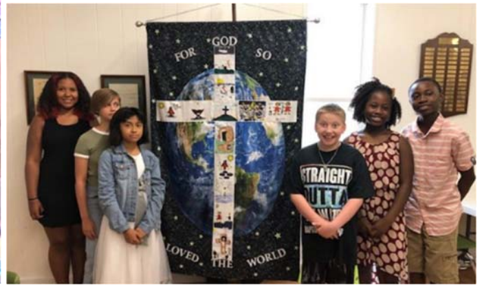
4 baptisms and 2 renewals at FPC Copperas Cove

We hope you will see by this Income Narrative how much we are getting for our money as churches - and how essential it is for ALL to give generously to keep engaging not only with our present ministries and responsibilities, but to imagine what we could do with more.