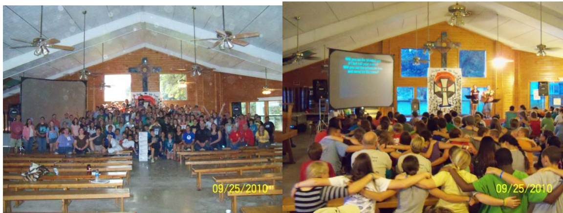
MAIN EVENT PARTICIPANTS